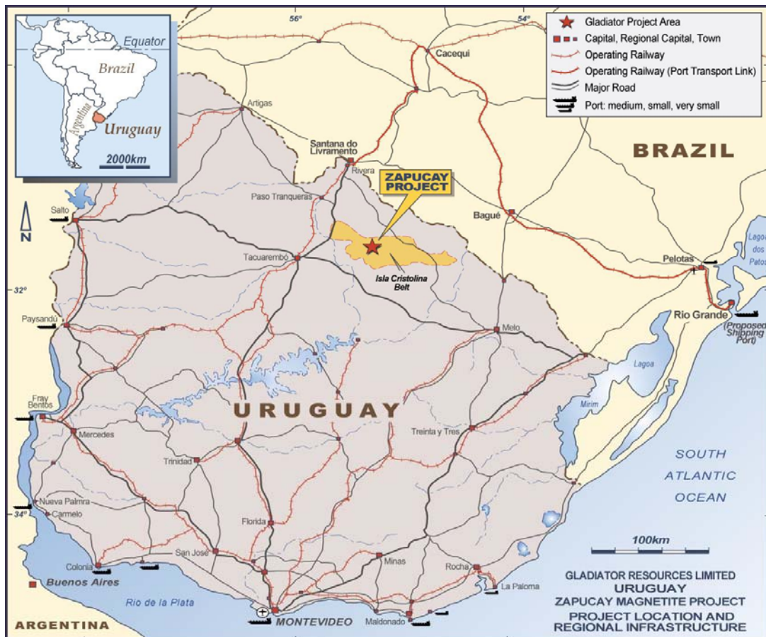
Figure 1: Location of the Zapucay Project and the Isla Cristalina Belt (ICB) in Uruguay